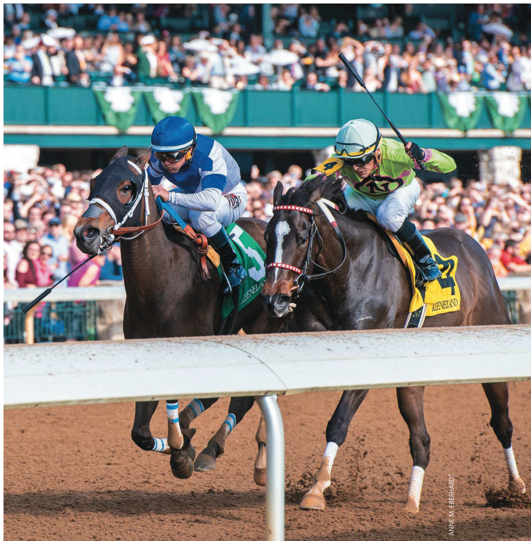
Cal-bred Spiced Perfection, outside, betters Amy's Challenge in Keeneland's grade 1 Madison Stakes

The gutsy California-bred filly duelled with pacesetter Amy's Challenge throughout, and the two of them threw down the gauntlet in the lane, with Spiced Perfection edging ahead, Amy's Challenge coming back to put her nose in front, and Spiced Perfection finally, resolutely turning her away at the wire. Behind them, by 6\frac{3}{4} lengths, toiled the likes of six-time stakes winner Late Night Pow Wow in third and 2018 Breeders' Cup Filly and