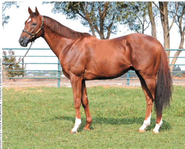
California's leading third-crop stallion, Smiling Tiger sired Spiced Perfection, 2018 Cal-bred Horse of the Year