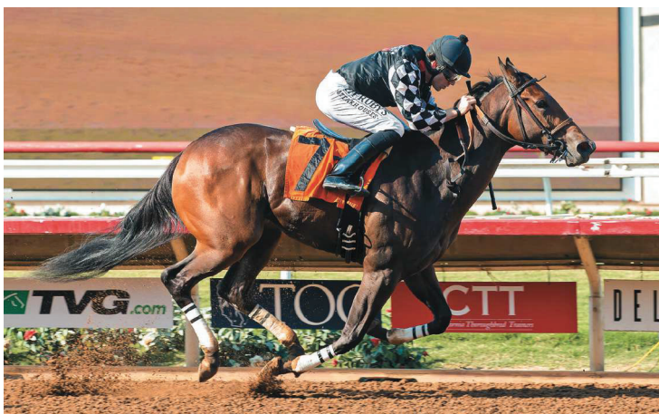
Spiced Perfection takes the Generous Portion Stakes as a juvenile, racing for Dare To Dream Stable